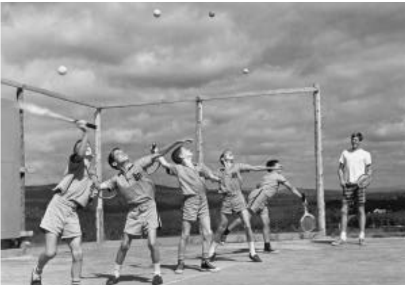
Tennis serves, 1960's